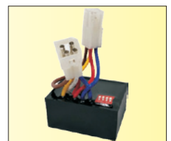
Energy Saving Module