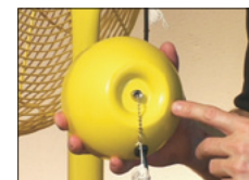
Recessed / Protected 2 Speed Pull Switch