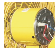
Long Life Motor

115 V, 1 Phase, 60 HZ, 1/4 H.P., T.E., PSC, 2-speed, 5/8" ball bearing, energy efficient motor (2.45 amps/240 watts) with detachable 18' three conductor power cord. Pull chain or rocker switch control.