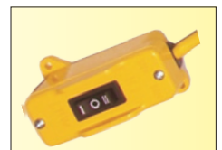
2 Speed Rocker Switch